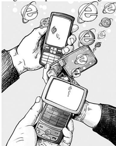
Figure 1 New media

In recent years, the development of new media has gradually become stronger, followed by the rapid spread of various new cultures. The young people of the new era are in the important stage of ideological transformation and development, and their outlook on life, values and world outlook will be greatly impacted under the background of the new era. Through various new media platforms, cultures around the world are displayed in the vision of college students. Influenced by the cultural diversity, the contemporary young people's thought gradually tends to diversify, and the style and thinking characteristics are more unique. Under the new media background, how to guide the students to establish their correct values and use the corresponding teaching means to gradually teach students to form the ability to distinguish between right and wrong has become one of the key research topics in the field of ideological and political teaching in today's universities.