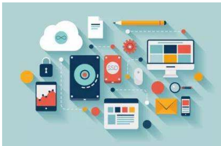
Figure 3 New media impact

Influenced by the new media, the teaching environment will gradually tend to be complicated. However, it is one of the major challenges in ideological and political teaching nowadays to guide students to form the ability to distinguish between right and wrong and establish correct values. The traditional information dissemination mode is very controllable, and the new media technology not only brings convenience to human beings, but also has some negative effects. Driven by interests, the dissemination of new media information will often appear expansionary, low-cost, borderless and other characteristics. The concrete manifestation is that some anti-china forces spread some bad information through the new media platform, which makes the ideological and political teaching environment of our country's colleges and universities tend to be complicated gradually, which has a very unfavorable influence on the formation of the correct values of college students in our country.